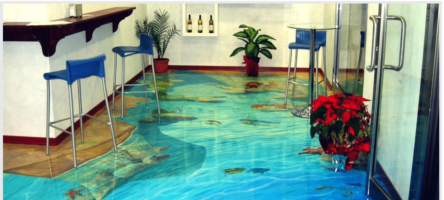
3D Epoxy Flooring