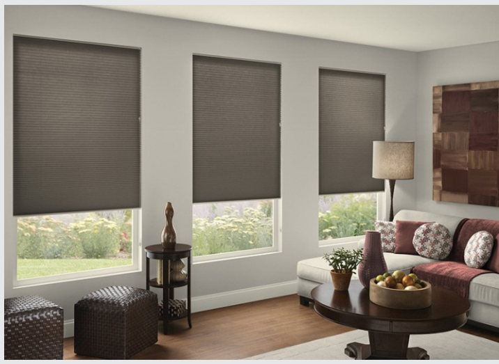
Roller Window Blind