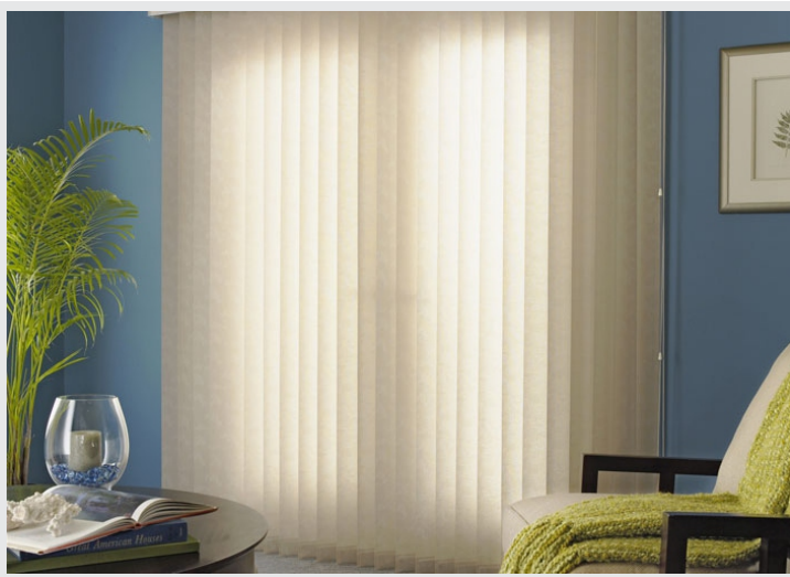
Vertical Window Blind