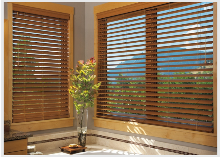
Wooden Venetian Window Blind